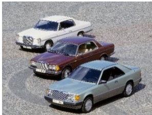
Mercedes-Benz coupés of the upper mid-range series

Further information: http://mb4.me/QfZyd0gW