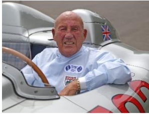
Sir Stirling Moss