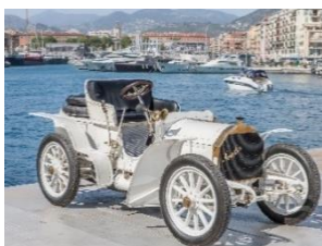
Mercedes-Simplex 40 PS from 1903

Further information: http://mb4.me/DkkN5wC8