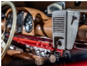
The "Klangfilm" speaker

Further information: http://mb4.me/NWYqzrLQ