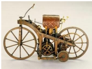
Gottlieb Daimler's “riding carriage”, 1885

A clear commitment to power 45 years ago: in spring 1975 Mercedes-Benz introduced model series 116's new, top-of-the-line model, the 450 SEL 6.9. The high-performance saloon was one of the fastest vehicles at the time, as only very few sports cars were able to reach even higher speeds. Nowadays, it's a sought-after classic. “The 450 SEL 6.9 is a brand icon,” Patrik Gottwick says as the Head of ALL TIME STARS, Mercedes-Benz Classic's own vehicle retailer. Further information: http://mb4.me/B4Vpr36v