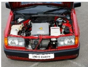
Mercedes-Benz 190 model, experimental vehicle with electric drive, 1991

Innovative, efficient drivetrains heralded the beginning of automotive history. The single-cylinder engine for which Gottlieb Daimler applied for a patent on 3 April 1885, 135 years ago, was a classic example of a spark that ignited interest and action in every respect. Due to its overall appearance, the novel combustion engine was nicknamed the “grandfather clock”. It was compact, lightweight and was the first high-speed petrol engine to develop 0.37 kW (0.5 hp) at 700 rpm from a displacement of 264 cubic centimetres. A curved-groove control system operated the exhaust valve via a disc mounted on the crankshaft and a transmission rod. Further information: http://mb4.me/bW3NrC7d