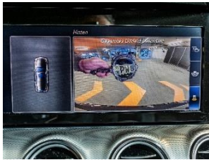
The hand-held mirror

Further information: http://mb4.me/WYSLvnPS