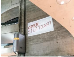
Guest performances by the Stuttgart State Opera