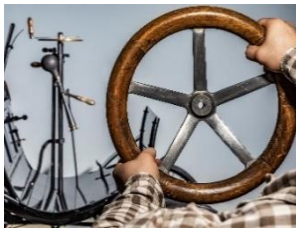
The steering wheel

Further information: http://mb4.me/JBIQ1nZx