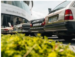
Cars & Coffee

Further information: http://mb4.me/pmv52kGM