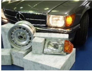
Mercedes-Benz Classic Online-Teilesuche