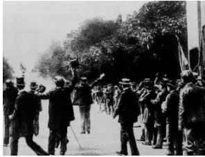
Paris-Bordeaux-Paris race from 11 to 14 June 1895