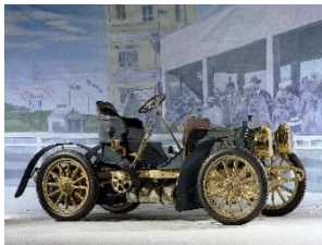
Mercedes-Simplex 40 PS from 1902

Further information: http://mb4.me/6mFYH2kz