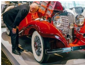
Shooting the first episode of the video series

Further information: http://mb4.me/LNe2MchG