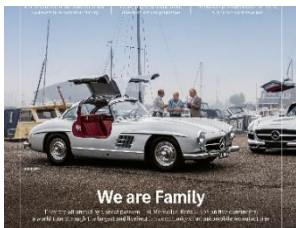
Mercedes-Benz Classic Magazin 1/2020

Further information: http://mb4.me/n2rZvP8o