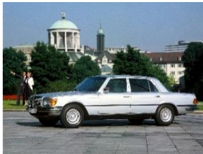
Mercedes-Benz 450 SEL 6.9