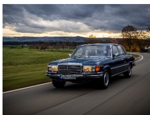
350 SE model series 116 (1972 to 1980)

Further information: http://mb4.me/NY08oXmG