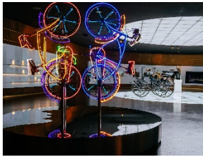
Robert Rauschenberg, "Riding Bikes", 1998