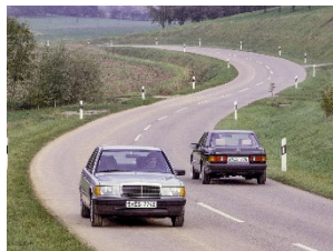
Mercedes-Benz 190 (right) and 190 E of the 201 model series