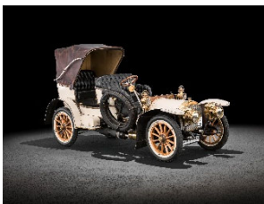
Mercedes-Benz Simplex 28/32 hp touring car

Further information: http://mb4.me/HLfvFms8