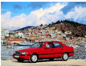
Mercedes-Benz C-Class Saloon from the 202 series

The part of the month is only one part of many, which are permanently reproduced by Mercedes-Benz Classic, as the all-encompassing and long-term supply of parts for all classics has top priority for us. Our corporate sales and logistics network guarantees the supply with our genuine Classic parts for your car anywhere in the world and thus they can be ordered from any authorized Mercedes-Benz dealer. Information about availability and prices can be found on our online parts search www.mercedes-benz.com/classic-parts which is updated regularly. There you can also make selections as for reproduced or promotion parts or you can order parts from the online shop (with delivery only to Germany).