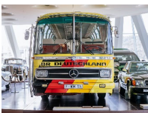
Mercedes-Benz O 302

Further information: http://mb4.me/LOfvSslY