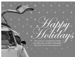
Happy holidays and a successful New Year

The part of the month is only one part of many, which are permanently reproduced by Mercedes-Benz Classic, as the all-encompassing and long-term supply of parts for all classics has top priority for us. Our corporate sales and logistics network guarantees the supply with our genuine Classic parts for your car anywhere in the world and thus they can be ordered from any authorized Mercedes-Benz dealer. Information about availability and prices can be found on our online parts search www.mercedes-benz.com/classic-parts which is updated regularly. There you can also make selections as for reproduced or promotion parts or you can order parts from the online shop (with delivery only to Germany).