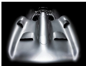
Mercedes-Benz Classic Magazine 2/2022

The part of the month is only one part of many, which are permanently reproduced by Mercedes-Benz Classic, as the all-encompassing and long-term supply of parts for all classics has top priority for us. Our corporate sales and logistics network guarantees the supply with our genuine Classic parts for your car anywhere in the world and thus they can be ordered from any authorized Mercedes-Benz dealer. Information about availability and prices can be found on our online parts search www.mercedes-benz.com/classic-parts which is updated regularly. There you can also make selections as for reproduced or promotion parts or you can order parts from the online shop (with delivery only to Germany).